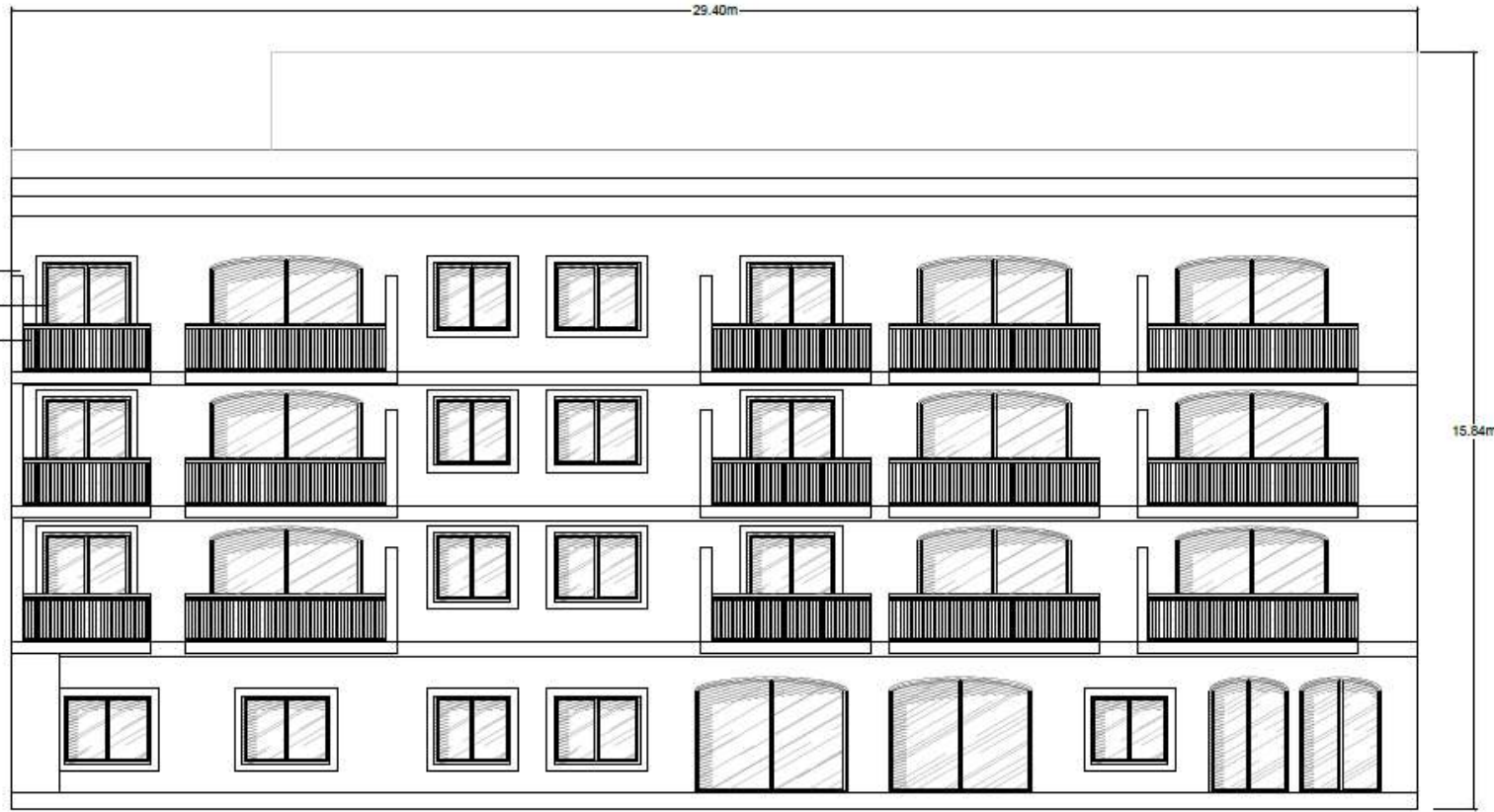
Proposed back elevation scale 1:100 clear copy

Franka stone unpainted White PVC apertures Wrought iron railings painted white