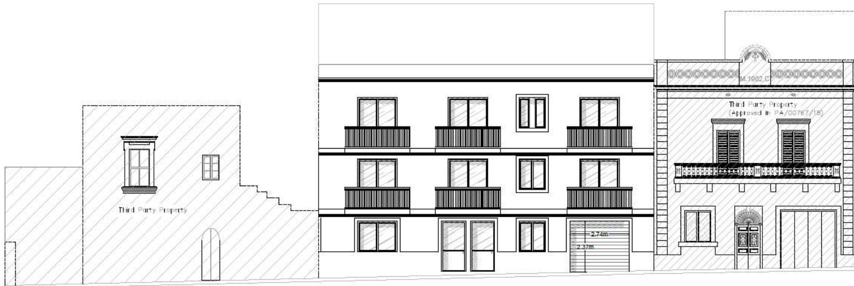
Proposed Front Streetscape elevation scale: 1:100 clean copy