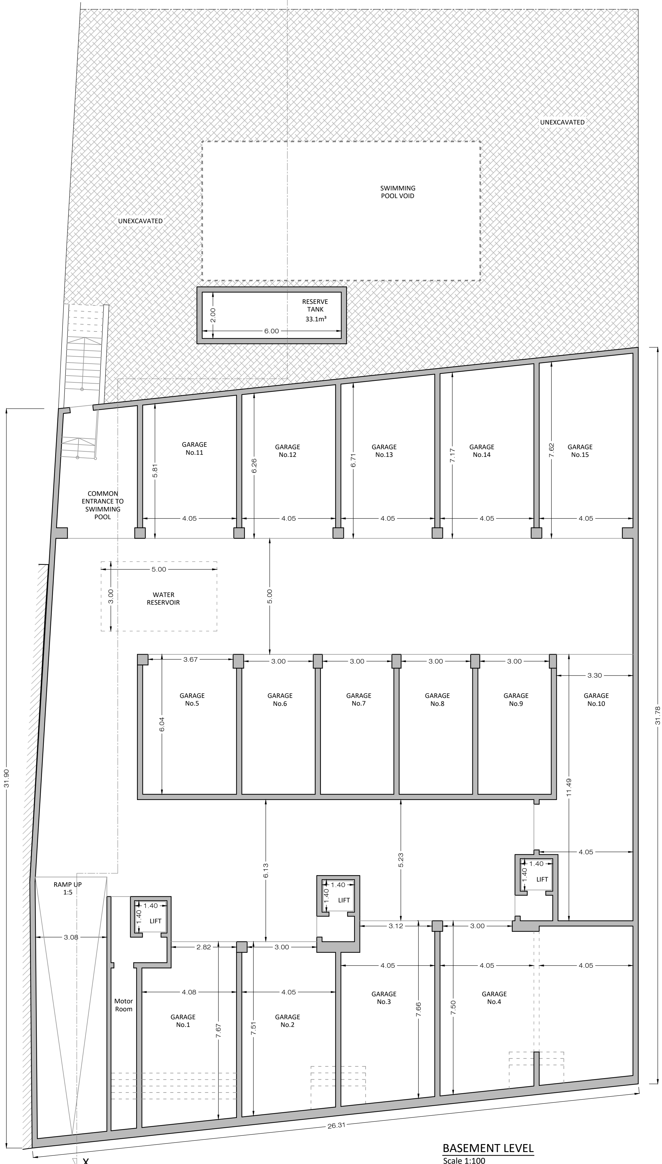
BASEMENT LEVEL Scale 1:100